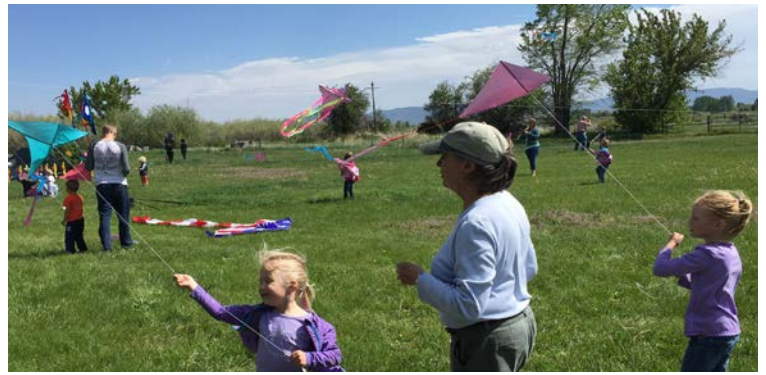
2016 Something in the Wind Festival