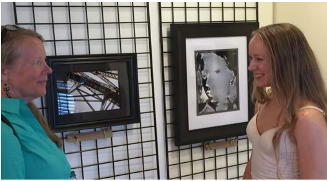
Six exhibits and receptions for 8 local artists