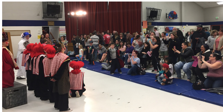
Missoula Childrens' Theatre - Scarselli Elementary