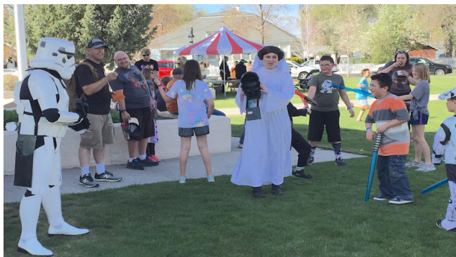
"May the Fourth be With You" in Minden