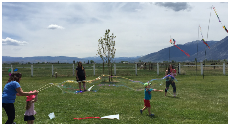
2018 Something in the Wind Festival