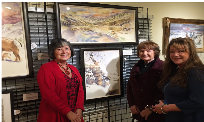
Six exhibits and receptions for 8 local artists