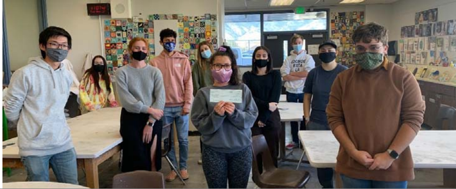
Douglas High School students with Carson Valley Arts Council mini-grant check for a Clay Extruder for the Art Department