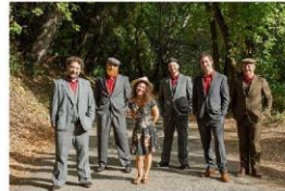
Harry & the Hitman